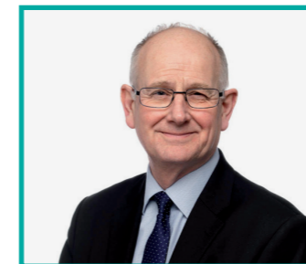
Roger Bright, CB Former - Chief Executive of The Crown Estate